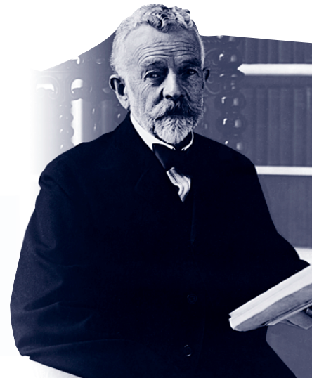
Senator Henry Cabot Lodge (1850–1924) opposed U.S. entry into the League of Nations.

Lodge's speech helped turn the public against the League. In this section, you will learn how the United States and Europe adjusted to the end of the war.