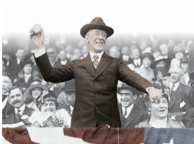
President Wilson throws out a baseball at the opening game of the 1916 season.

The Federal Reserve Act created a more flexible currency system by allowing banks to control the money supply. To raise money, for example, the Federal Reserve Board, or “Fed,” lowers the interest rate that it charges member banks. These banks then borrow more from the Fed and thus have more money to lend to people and businesses.