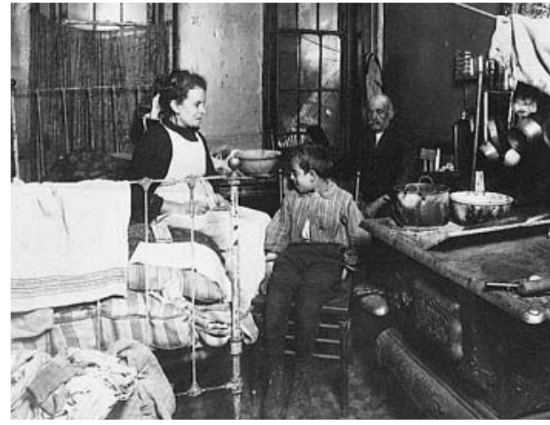
This photograph shows an immigrant family in a crowded tenement at the turn of the century.

Another group of reformers who wanted to improve social welfare were the prohibitionists. They worked to prevent alcohol from ruining people's lives. The prohibitionists built on the temperance movement of the 1800s.