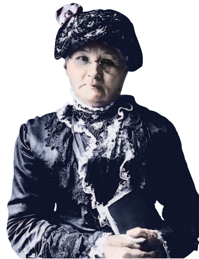
Mother Jones won the love of working people by fighting for their rights.

Mary Harris Jones, Autobiography of Mother Jones