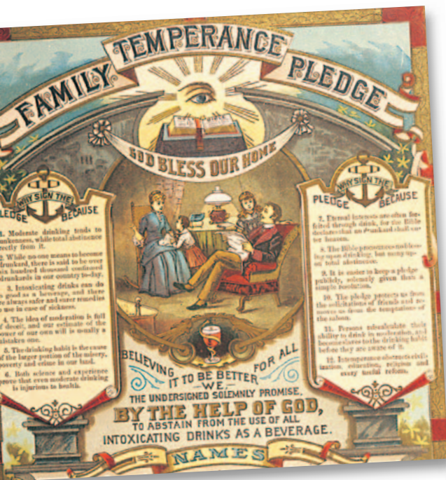
Temperance pledges often displayed inspiring pictures and mottoes.